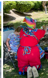
The 2025 HCW Annual Picnic was a great afternoon for the families in the community. Thank you to everyone who helped with the fun.